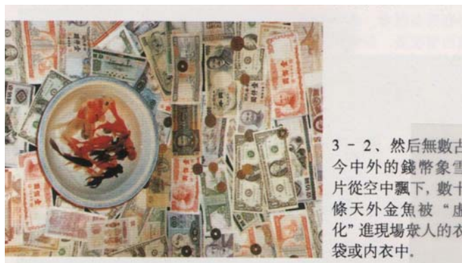
3 - 2、然后無數古今中外的錢幣象雪片從空中飄下，數十條天外金魚被“虛化”進現場眾人的衣袋或内衣中。

(Words beside the picture: then out of void numerous ancient and modern, Chinese and foreign coins fell down from the air like snowflakes and tens of golden fishes entered everyone's pockets on the spot.)