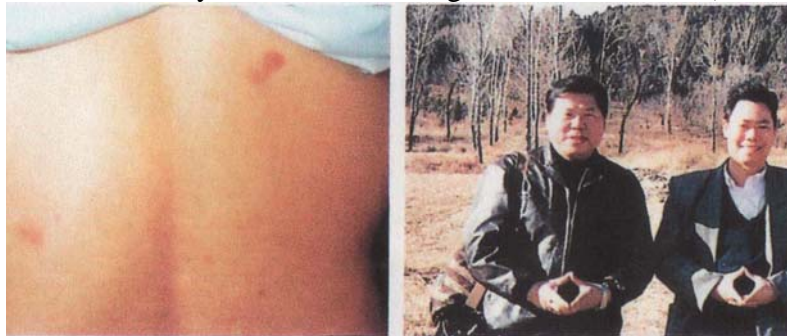
2 - 1、2 - 2、1994年12月15日，李寧在北京東直門外通過電話發功，把紅印點在遠在10公里之外的甘家口從未謀面的解放軍報記者車夫大校的背上。李寧與車夫到北京懷柔考察。

On December 15 1994, Li Ning, over telephone outside Beijing Dongzhimen, released energy affixing a red spot on senior colonel Che Fu’s back in Ganjiakou ten kilometers away, who was the reporter of People Liberation Army and whom Li Ning never saw before. (Picture 11)